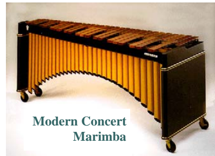
Modern Concert Marimba

Around 1910 marimbas began being made in the United States. The design changed again when the Deagan company of Chicago removed the wooden box pipes replacing them with round, metal ones. The marimba has further evolved as the keys have been rearranged so that the notes are chromatic, like a piano.