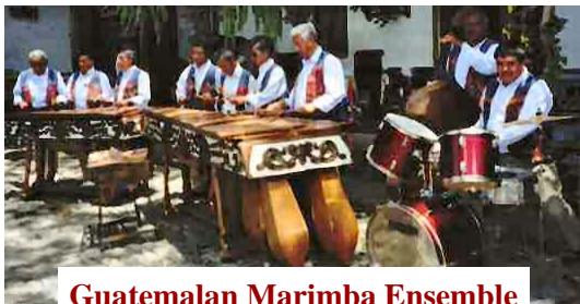
Guatemalan Marimba Ensemble

During the 16th century the marimba was brought by slaves to South America. The instrument migrated north to Central America and in the late 19th century, a Guatemalan, Sebastian Hurtado, removed the gourds from the Marimba and replaced them with wooden boxes. This new design was the basis of today’s marimbas. This design is referred to as a six and a half octave Marimba and is still the national instrument of Guatemala.